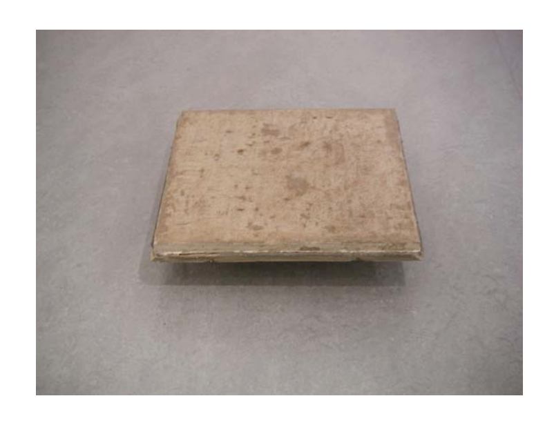
'Presence' Action Research