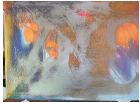
Title 5 hrs 40 minutes